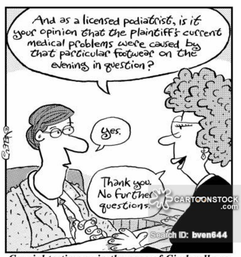
Crucial testimony in the case of Cinderella vs. the Association of Fairy Godmothers.